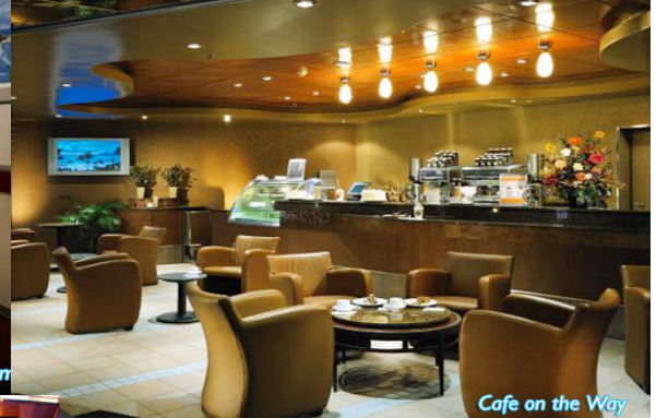
Cafe on the Way