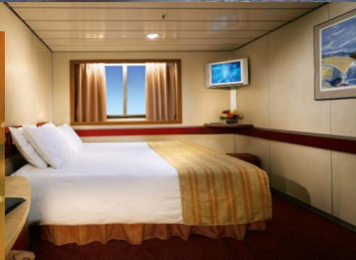
Category 6 - Oceanview Stateroom