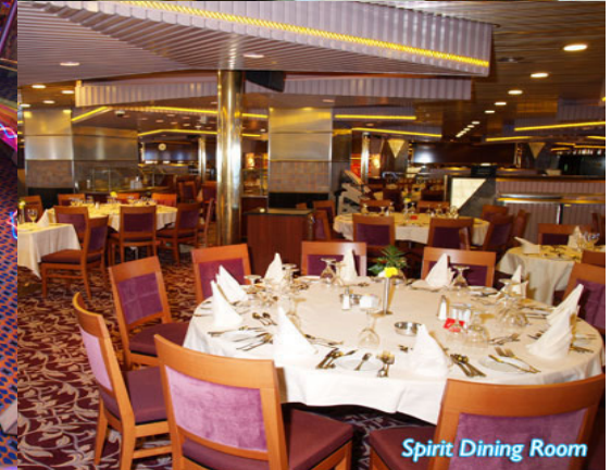
Spirit Dining Room